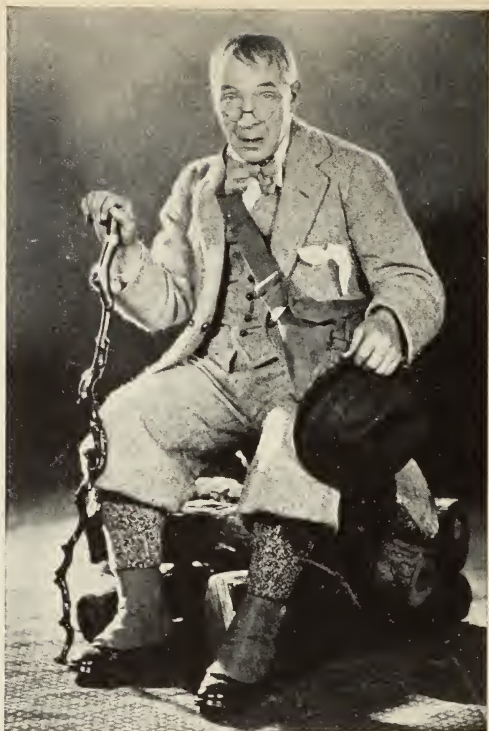
The Famous-Lasky Film Service Ltd.